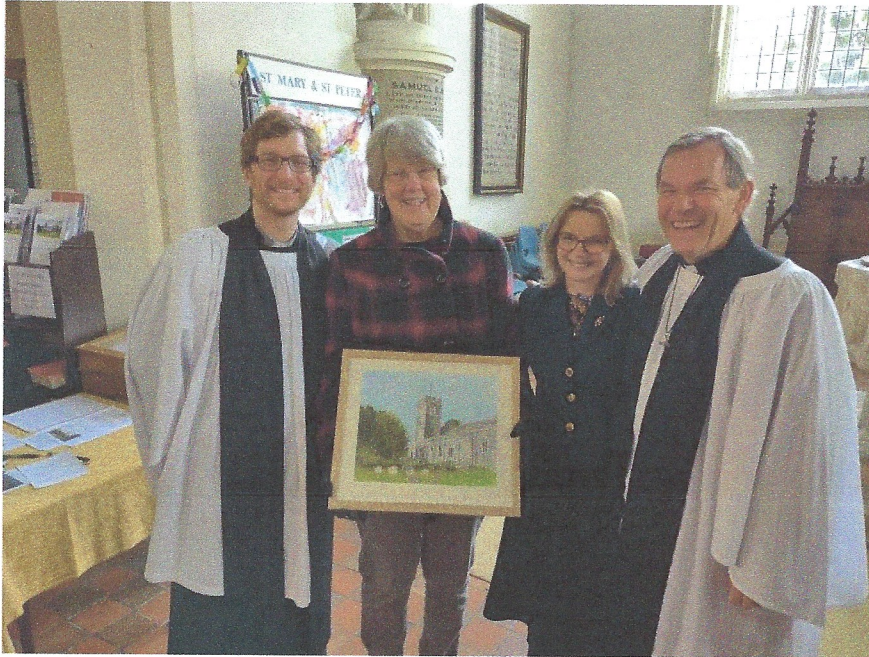
Some members of the Church's large Ministry team saying farewell to a retiring Churchwarden.