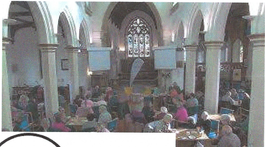
Informal worship at SKC Church in Saxmundham